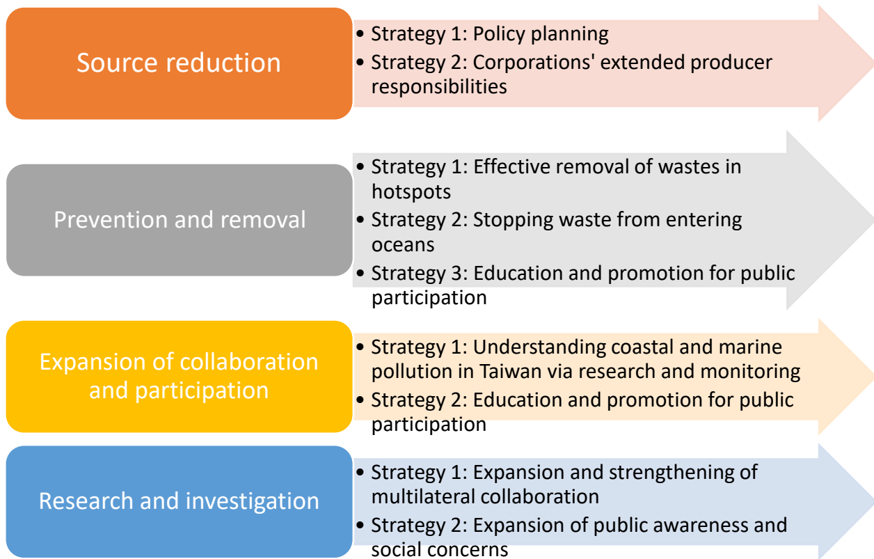
Figure 1. Taiwan Marine Debris Governance Action Plan (Environmental Protection Administration, 2021)

section, which is an integral part of Presidential Decree no. 83 the Year 2018 (Peraturan Presiden Indonesia, 2018).